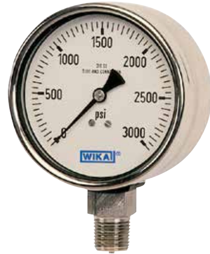
Bourdon Tube Pressure Gauge Model 232.30, 4"